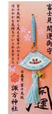
Up) A talisman with shape of Mount Fuji. Left) Suwa Shrine