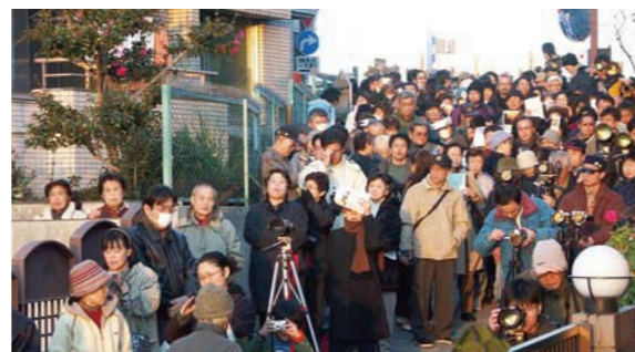
Diamond Fuji from the slope (Jan 30, 2011 by Tadashi Ishikawa)

Shining of the sunset at the peak of Mount Fuji is called the Diamond Fuji. After the sun rolled down the ridge, mountain shows a beautiful silhouette. This is visible twice a year, late January (around 29-31) and mid November (around 11-13).